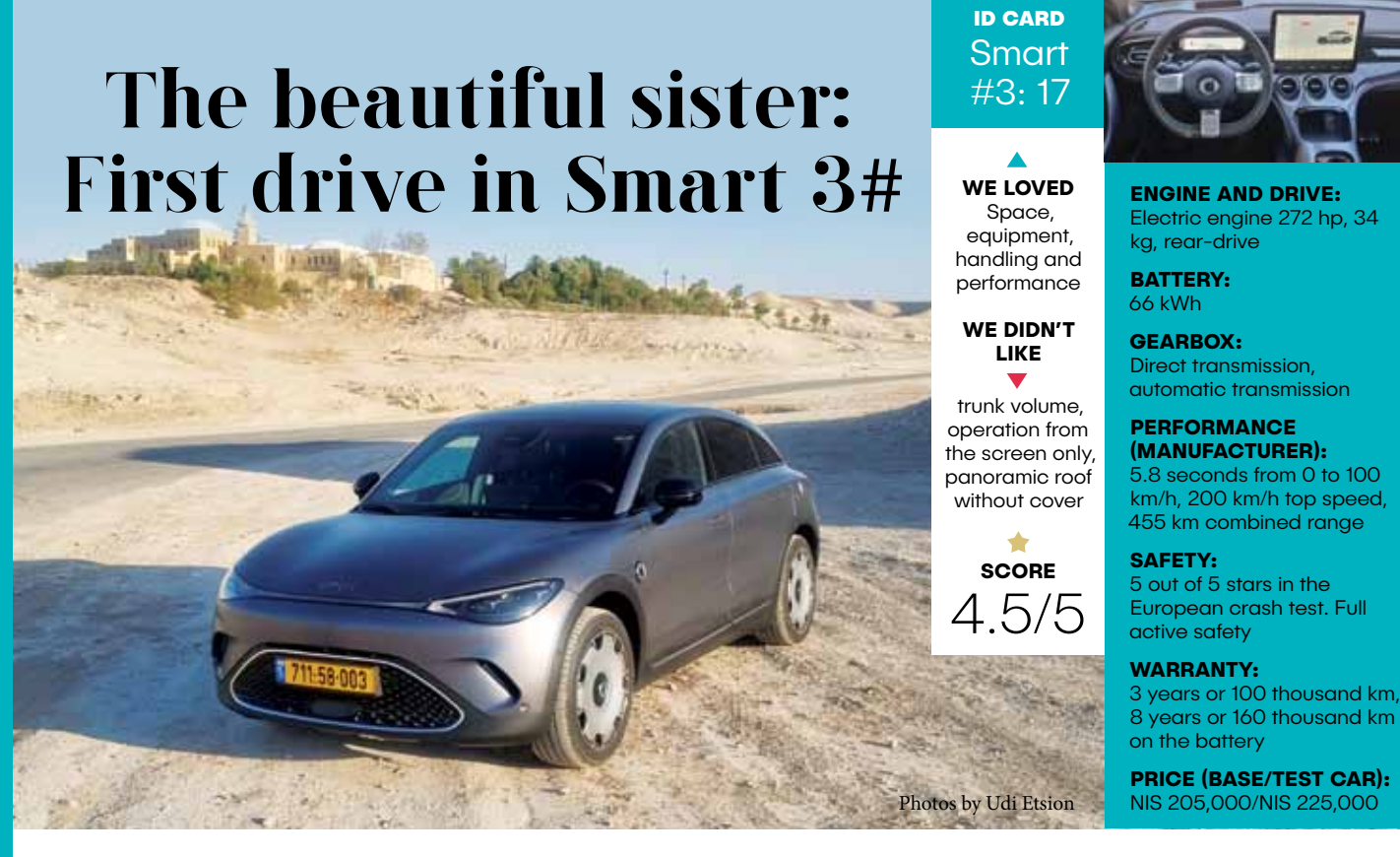
This new crossover coupé cleverly uses both German and Chinese genes to create an unusual electric car which costs much less than most competitors.